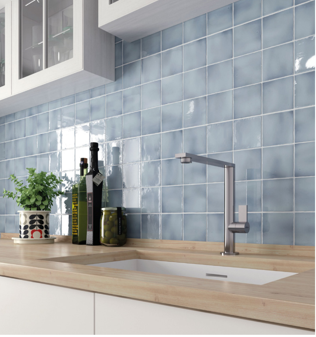
Variation is an inherent property of tiles and stone. Sizes are nominal and may include a joint.