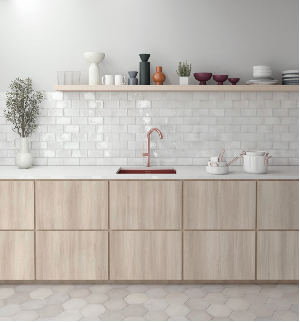
Variation is an inherent property of tiles and stone. Sizes are nominal and may include a joint.